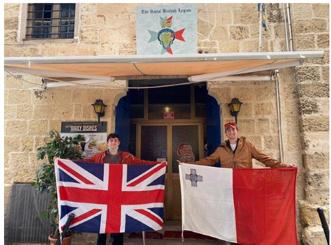
Two young Members raised funds to support the Poppy Appeal in Malta